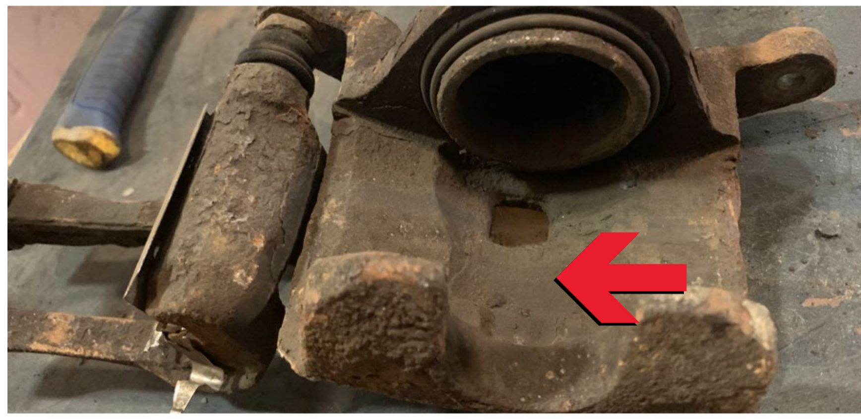
1 SCARRED / CUT FROM WHEEL / ROTOR