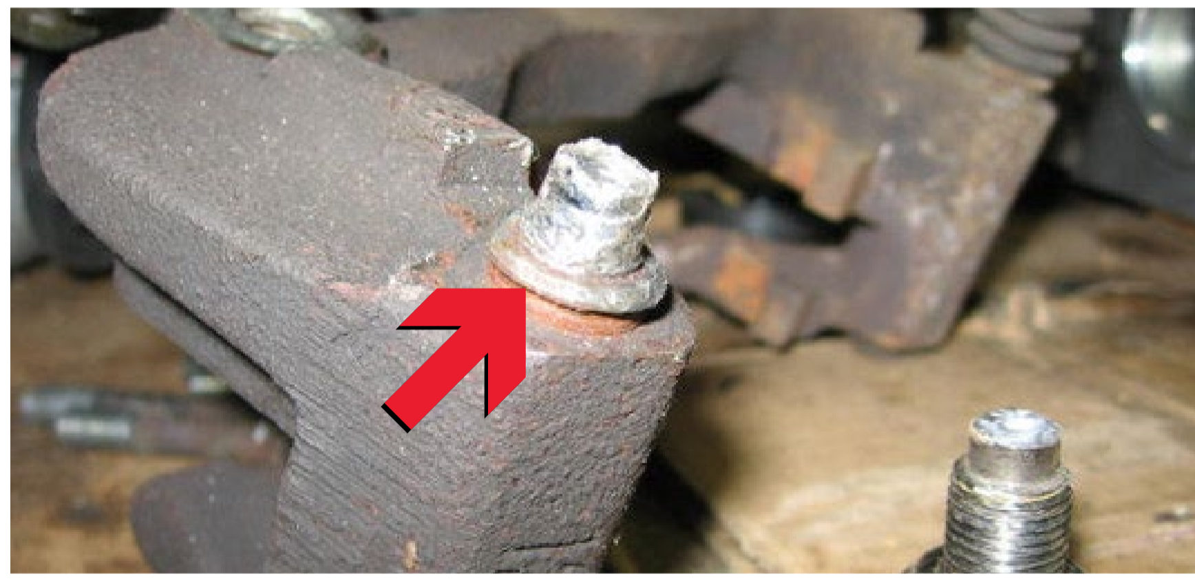
5 BROKEN CALIPER BOLT / PIN