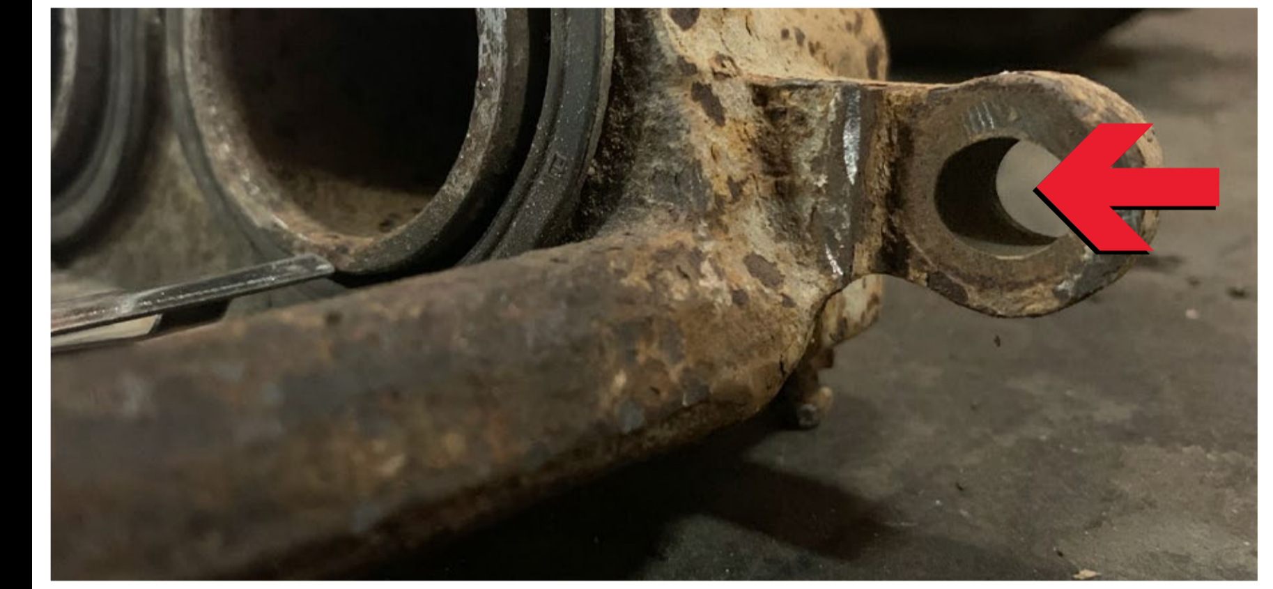
4 BROKEN / DAMAGE / WORN EAR TABS