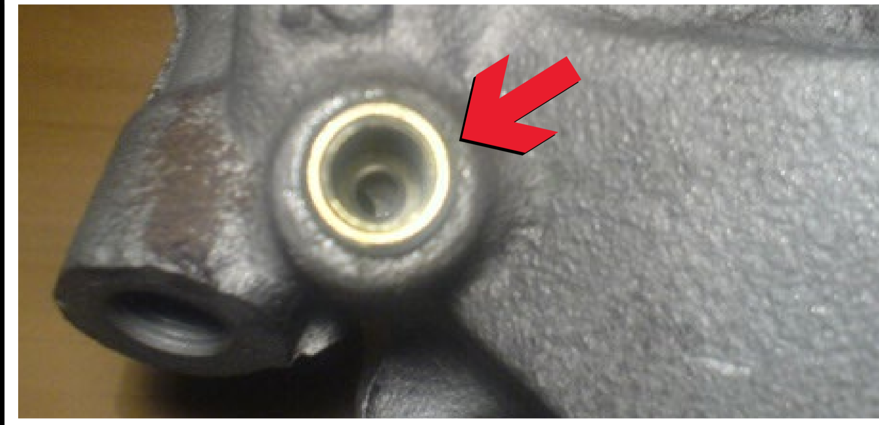
10 BLEEDER INLET MODIFIED / HELICOIL