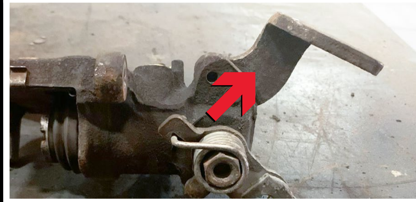
7 MISSING EMERGENCY BRAKE LEVERS