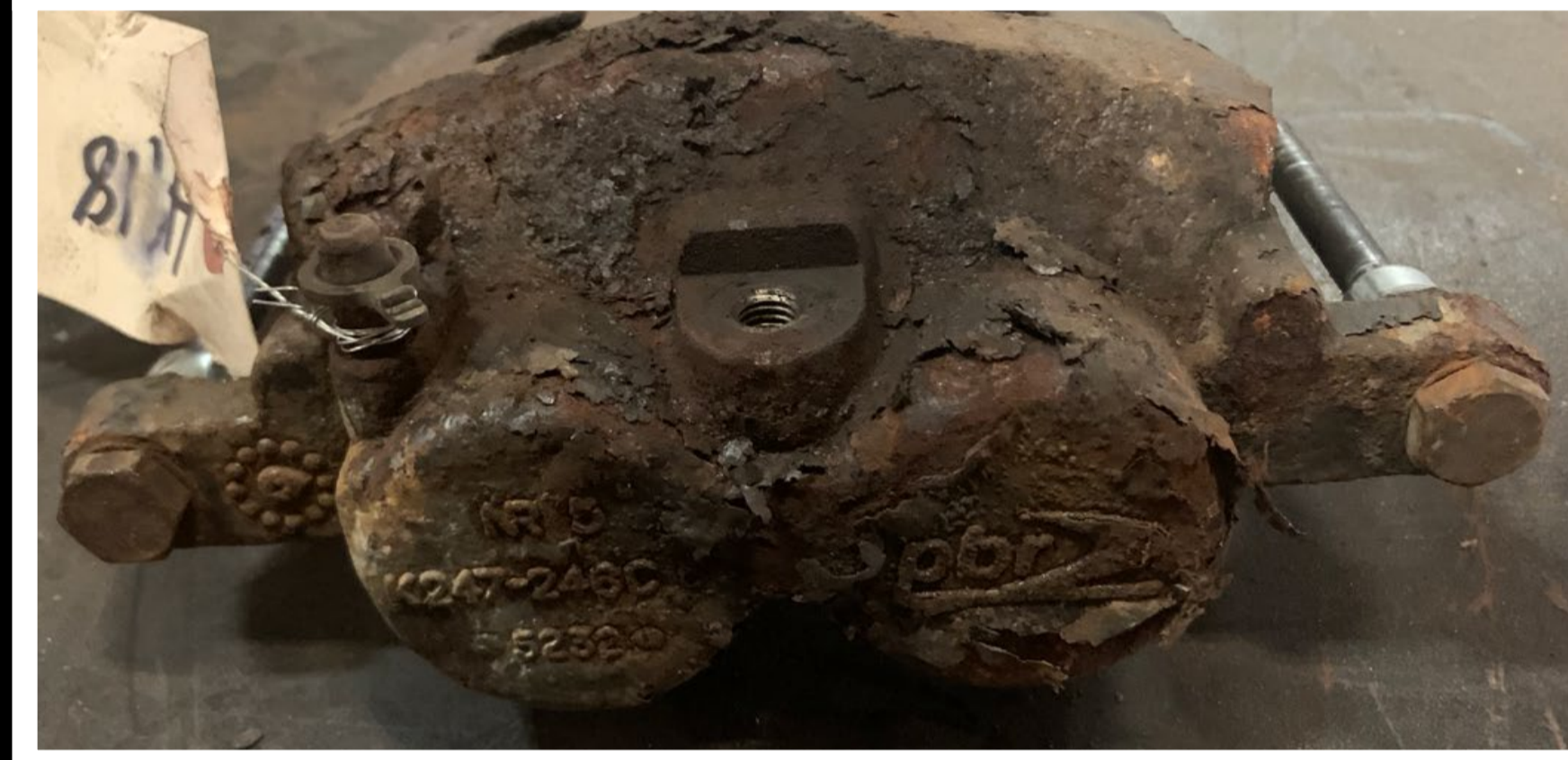
3 EXCESSIVE CORROSION / PITTED