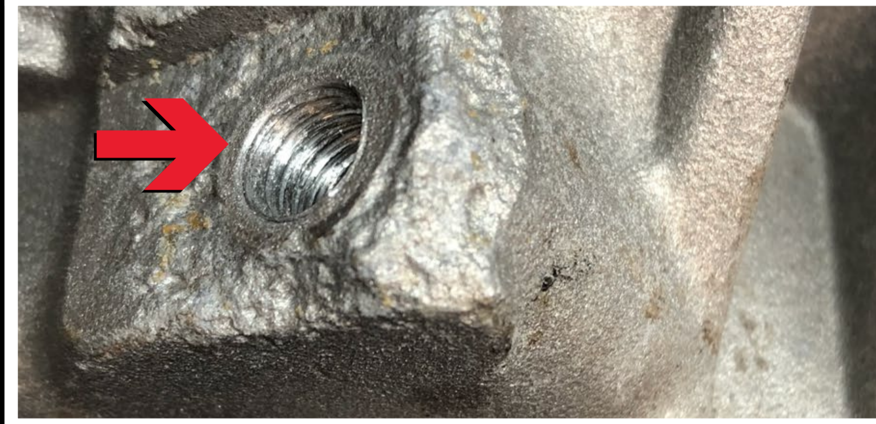
2 DAMAGED / STRIPPED INLET THREADS