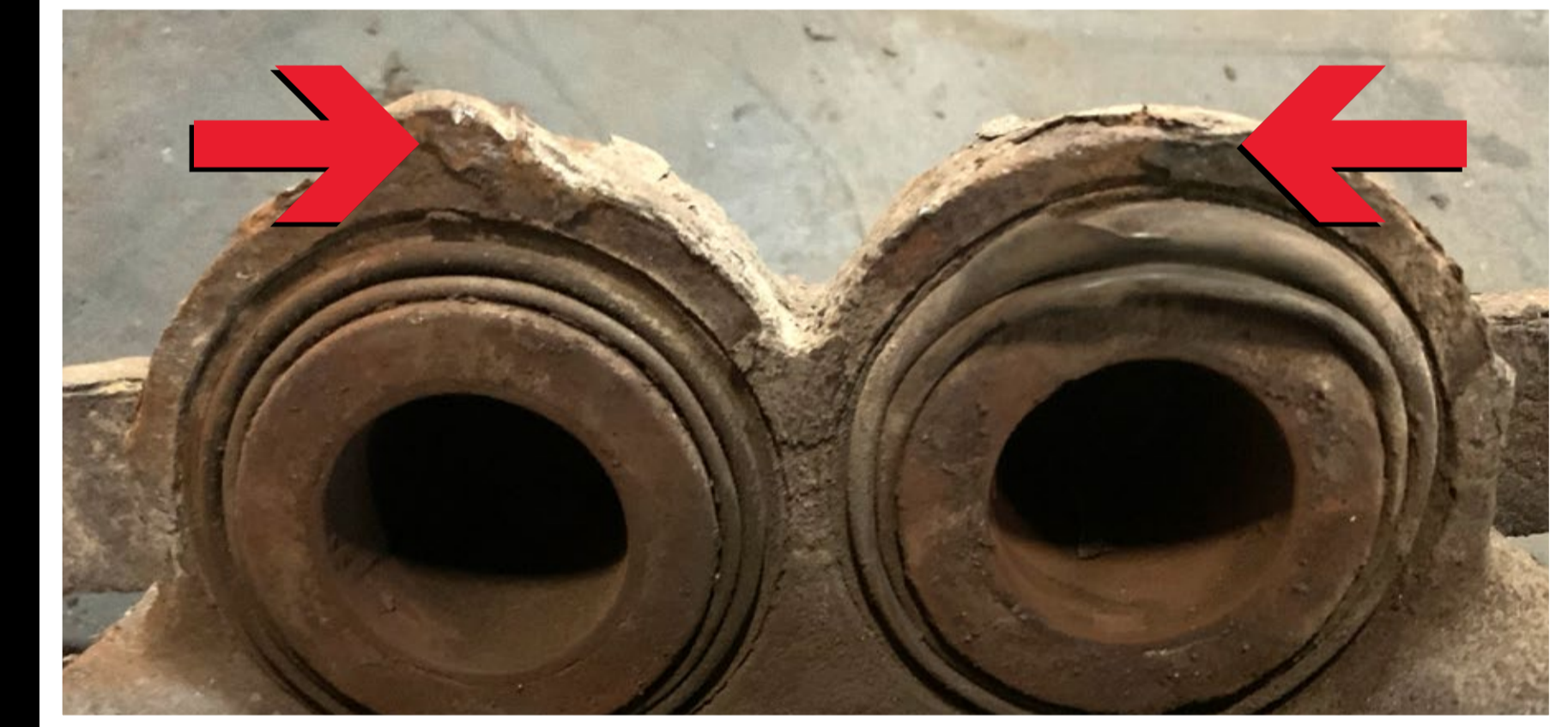
8 CRACKED OR BROKEN CASTING / BRACKET