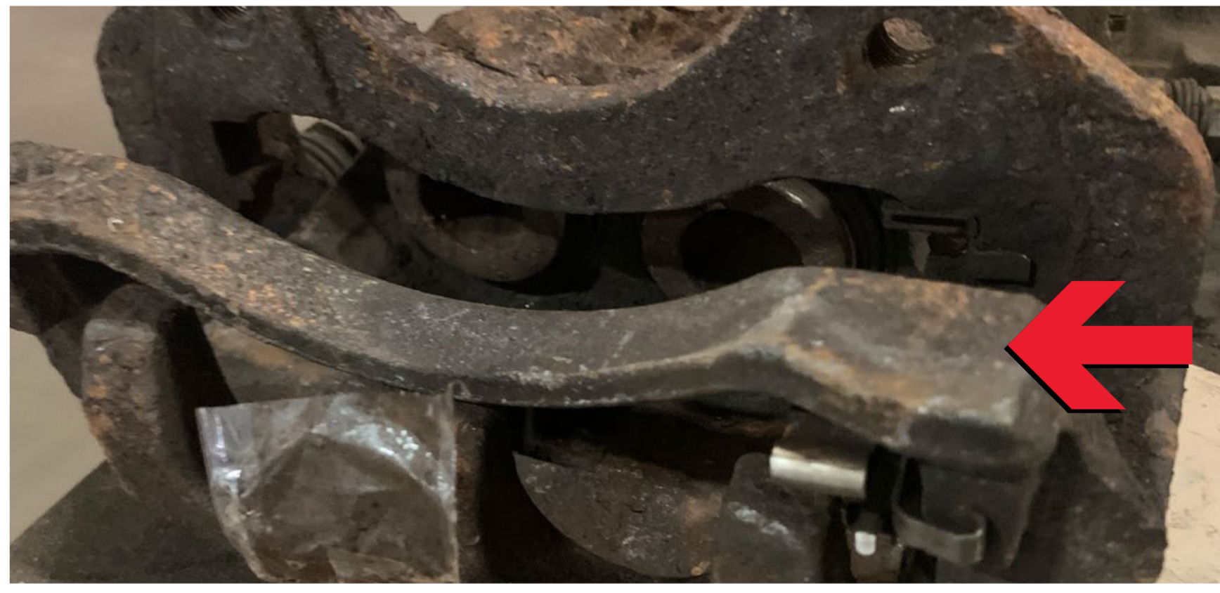
9 MISSING OR DAMAGED BRACKET